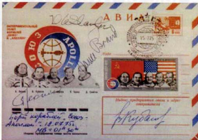
Top: Cover type #3 has the ASTP Crew in front of the emblem, mirroring the 10 kopek stamp, in which the crew has been lined up to the same height. Note that only four signatures appear on this cover – Tom Stafford missed this one.

Deke Slayton had always refused to sell the ASTP flown covers he had. In a letter he addressed to Walter Hopferwieser in May 1989, he confirmed that he had signed in space such covers and certified the authenticity of samples submitted to him, but added: "I have no interest in commercializing on the ones that I do have. They will be put on display in a museum at the appropriate time".