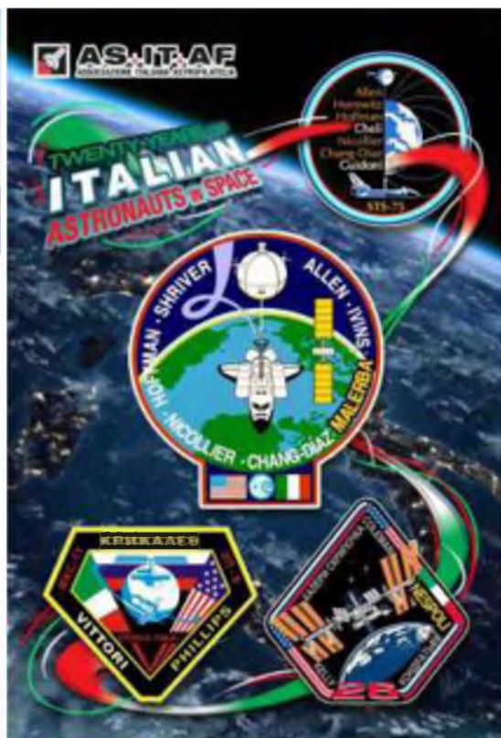
AS.IT.AF. commemorative card by © Alec Bartos.

Malerba is shown as part of the STS-46 crew in this 2010 issue from Malawi. Cheli and Guidoni are shown in a similar stamp in the series below right.