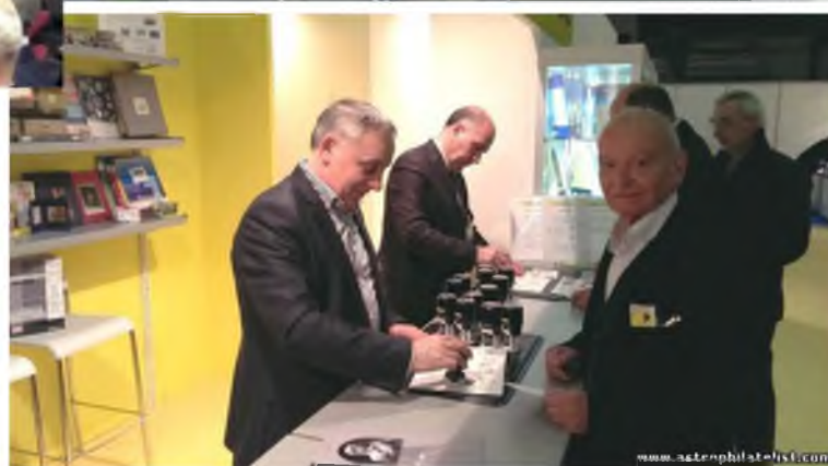
A number of Postal administrations from European countries presented at the exhibitions and prepared their own postal cancellations devoted to the event.