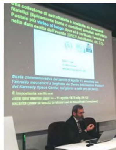
Cf http://astrophilatelista.com/index/milanofil_2014/0-1070 for more in full colour