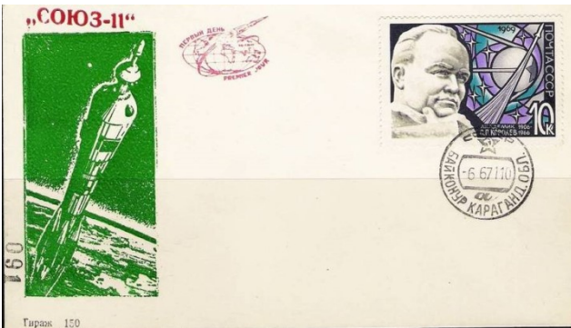
On the left: Soyuz 11 ( Lollini € 500,00). On the right Soyuz 11 ( Cosmophila - € 250,00)