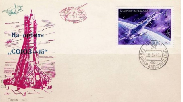
On the left: Soyuz 15 ( Lollini € 208,00). On the right Soyuz 15 ( Cosmophila - € 90,00)