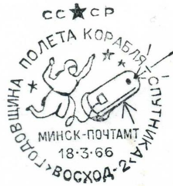
A fixed-date pictorial postmark was used on March 18th, 1966 to commemorate the first anniversary of the launch of Voskhod-2. The text in the external crown reads in Russian "Anniversary of the flight of the sputnik spacecraft Voskhod-2"

But this is not the last drawback of the mission.