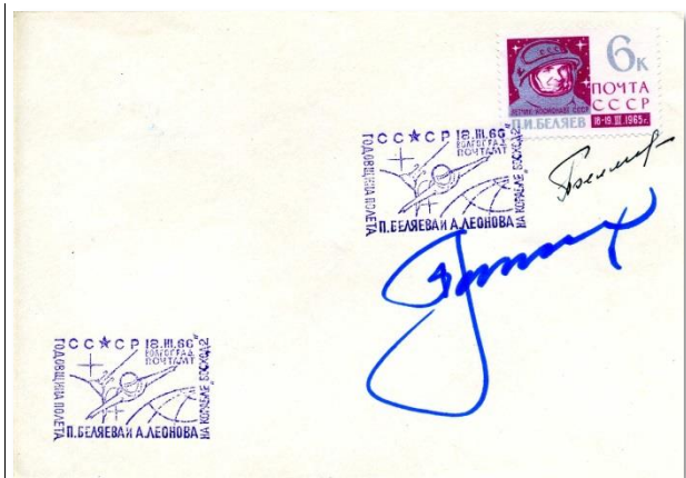
To commemorate the first anniversary of the flight a pictorial postmark was used on March 18 th 1966 in 6 different postal facilities throughout the Soviet Union: actually Moscow, Moscow International, Kemerovo, Volgograd, Perm and Vologda. The post-office where the postmark was used is identified just below the date. The external text reads in Russian "Anniversary of the flight of P.Belyayev and A. Leonov in the spacecraft Voskhod-2". Among the most interesting are the cover cancelled in Perm and in Volgograd. Perm, in the Ural mountains, was the rural locality nearest to the landing place (about 75 kilometres, 47 miles) with a small post-office. The inhospitable forest is featured in the cover cachet and the green ink was used for the postmark. This is the first space-related postmark used, during the Soviet Era, in Volgograd which was the largest city near to the Kapustin Yar cosmodrome, at that time still secret.