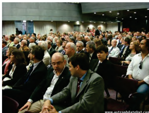
View of the meeting of the FIP Astrophilately Commission in Lisbon.

The Bureau of the FIP Section for Astrophilately and congratulate all Astrophilately-collectors with the 25th Anniversary of our Section.