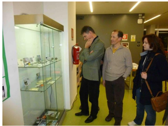
Paolo Nespoli visits WOMEN IN SPACE and the SPACE FOOD exhibition