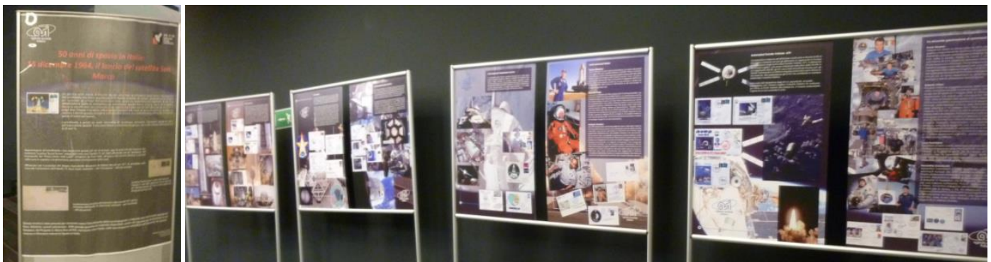
On the left :the introductory board. On the right: 18 display panels at the exhibition.

The exhibition consists of 18 panels plus an introductory one which explains what astrophilately is. It traces the main goals reached during half a century of Italian space successes.