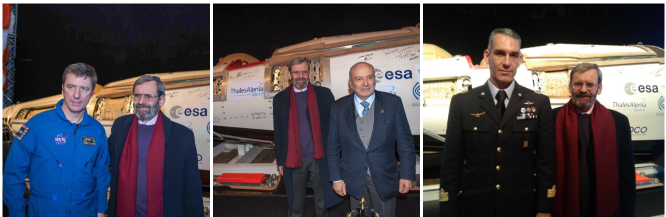
Roberto Vittori, Franco Malerba and Valter Villadei

The event offered tthe opportunity to meet several astronauts who took part in the celebrations in Turin