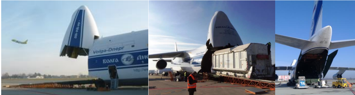
Left: the Antonov "kneeling" in loading position, on the Turin-Caselle runway

A few days before Christmas we accompanied ExoMars which departed from the Sandro Pertini airport in Caselle , Turin with destination Baikonur , the Russian launch base in Kazakhstan. To transport the European probe with all its equipment and apparatus, three flights of a capable Russian Antonov AN-124-100 cargo plane were required. The flights rotated in succession in just five days, with an exhausting work rate involving thirty people.