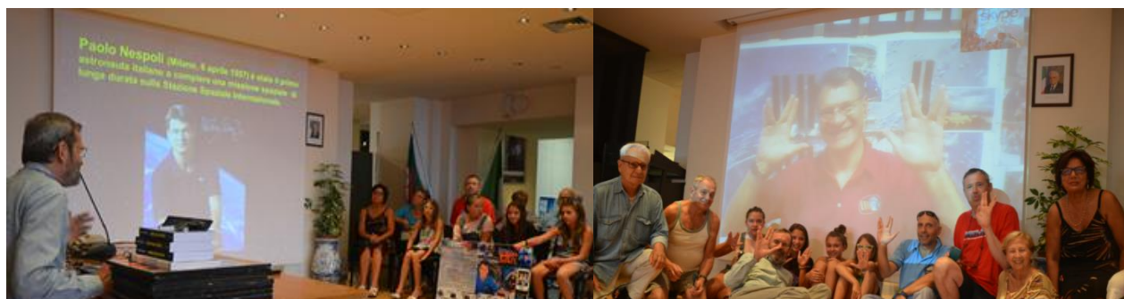
During the live connection with Paolo Nespoli

Astronaut Paolo Nespoli , the first Italian to make two long term space expeditions. participated in the SCIENZA FANTASTICA event connected live from Star City (Moscow) , where at that time he was being trained, in preparation for his long lasting expedition that would have seen him engaged in research on the Space Station, for the third time.