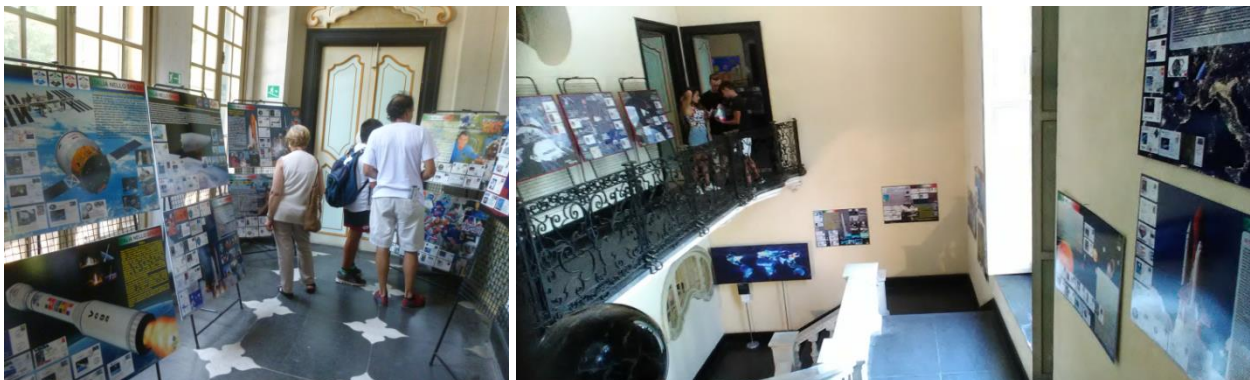
The ASITAF panels on show at Villa Borzino in Busalla