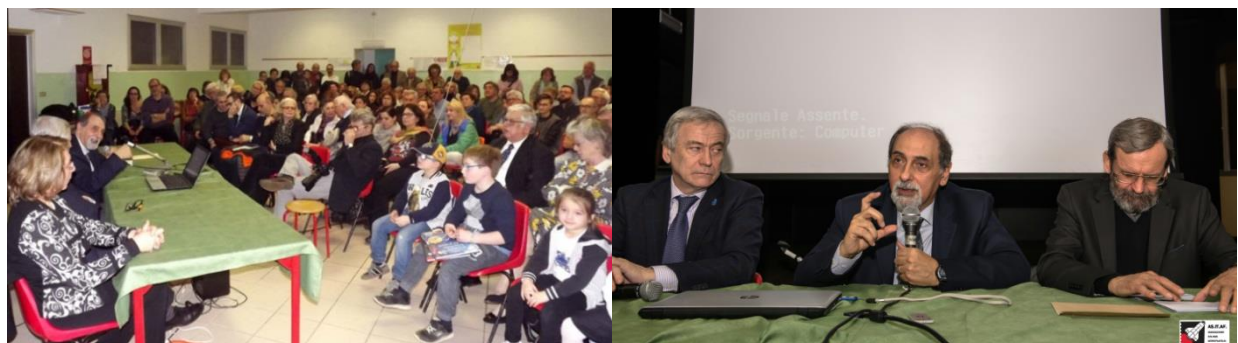
Umberto Guidoni during the conference "A flight beyond the sky".

In the afternoon Guidoni entertained the public, in a crowded meeting room, with his lecture “A flight beyond the sky” speaking about his experience during his two flights into space.