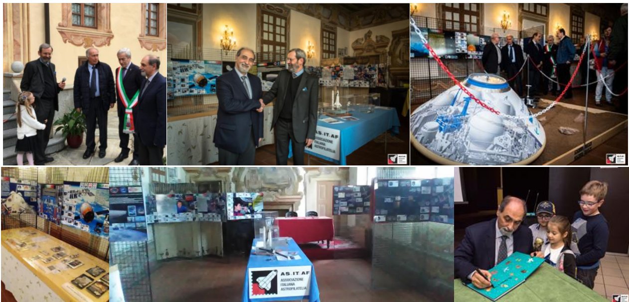
The exhibition in the hall of Palazzo Mistrot

In the afternoon Guidoni entertained the public, in a crowded meeting room, with his lecture “A flight beyond the sky” speaking about his experience during his two flights into space.