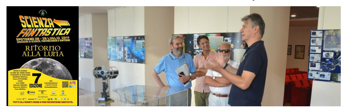
ASITAF presented the panels "APOLLO PROGRAM: 5 steps towards the moon and beyond".

The topic of the 7th edition of SCIENZA FANTASTICA, sponsored by ASITAF was RITORNO ALLA LUNA (BACK TO THE MOON). Guest of honor was Paolo Nespoli.