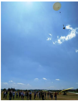
At 13.26, the meteo conditions at the Annone area proved to be optimal, and the TSV3 capsule, with its 8370 liters of helium, detached from the ground greeted by thunderous applause from those present.