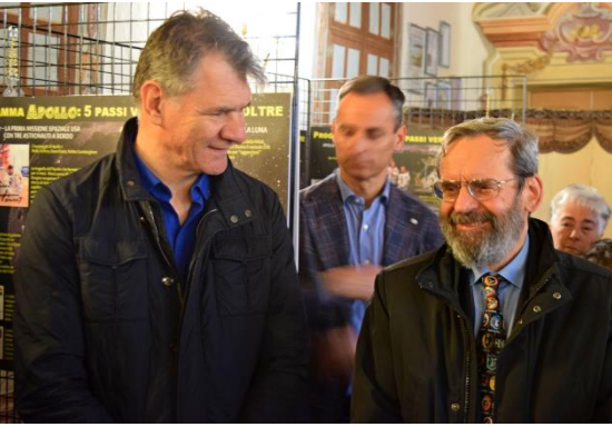
Opening of the exhibition