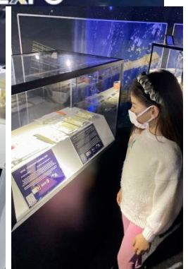
Space Food on show at SPACE ADVENTURE in Istanbul (Turkey)